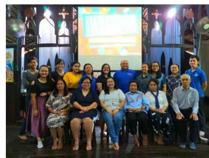
Teachers and Assistants